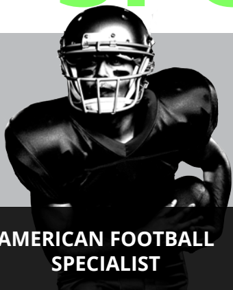
AMERICAN FOOTBALL SPECIALIST