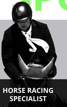
HORSE RACING SPECIALIST

With great attention to detail, our Horse Racing specialist believes that every horse (and jockey) deserves a good name. He is an expert in every aspect of horse racing, from the starting barriers to the horse training and beyond. He likes to attend as many horse racing competitions in person as possible, because it's where he—and his writing—really come alive.